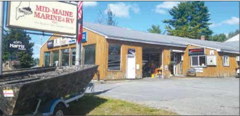
Mid-Maine Marine in Oakland, sells a wide variety of boats from bow riders to pontoon boats to salt water fishing boats.