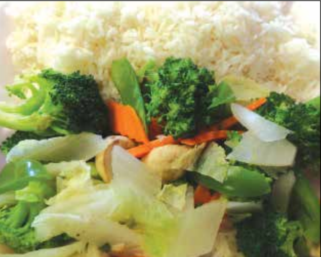
You can’t go wrong with an order of fresh steamed rice and veggies.

There are full course dinners available for two to four people, combination plates, house specialties, appetizers and appetizer combinations and soups, which include hot and sour, wonton, noodle, vegetable or egg drop. Fried