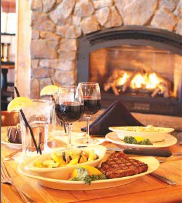
A fireside table adds ambiance to this inviting dinner for two.