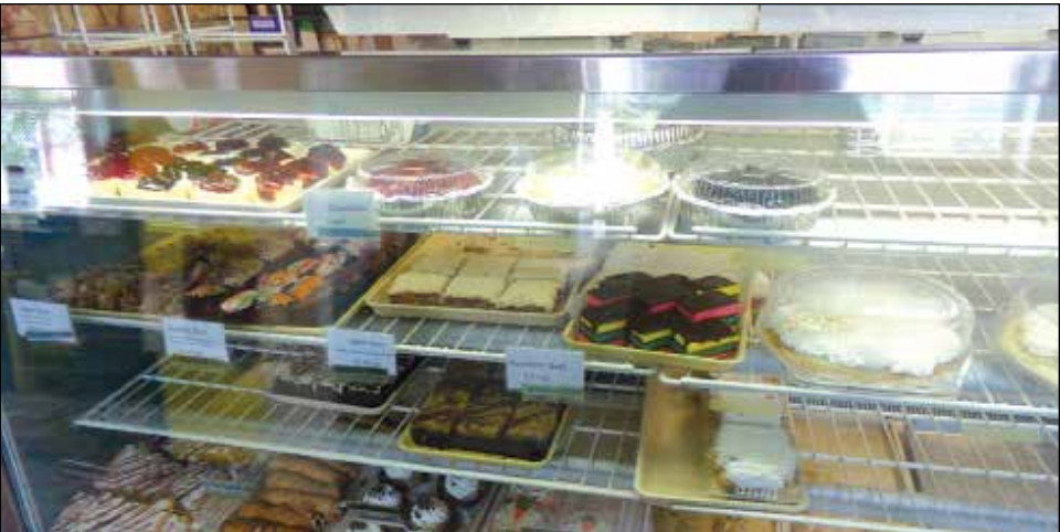
One of the show cases filled with an assortment of pastries, muffins and pies.

TERRY ROGERS, A 25-YEAR VETERAN BAKER AT HILLMAN’S