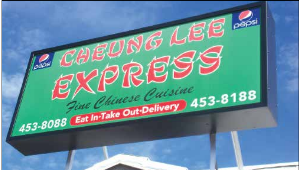
You can’t miss the bright green and red sign for Cheung Lee Express in downtown Fairfield.