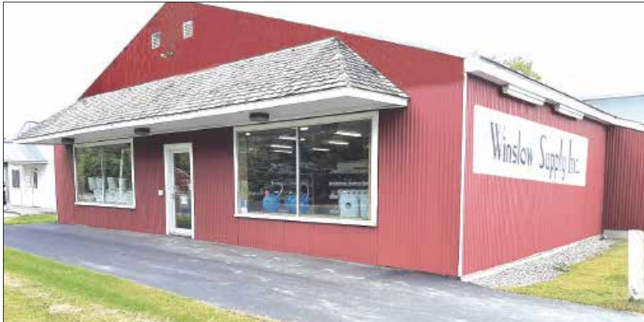
Winslow Supply, Inc. 567 Benton Ave. Waterville.