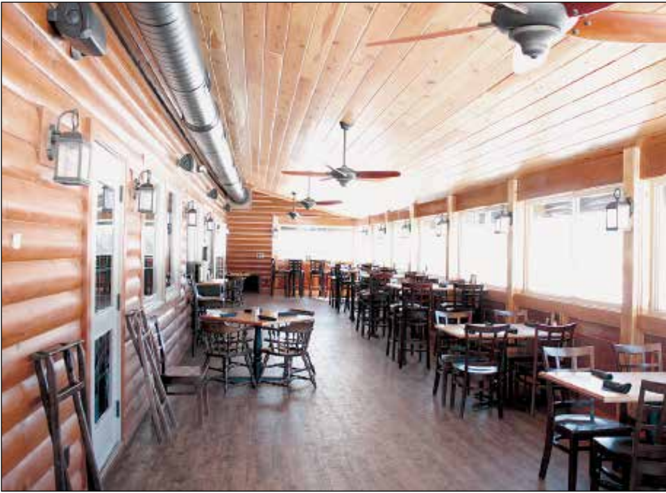
Four-season country charm surround deck diners in comfort.

A full menu change occurs two to three times a year.