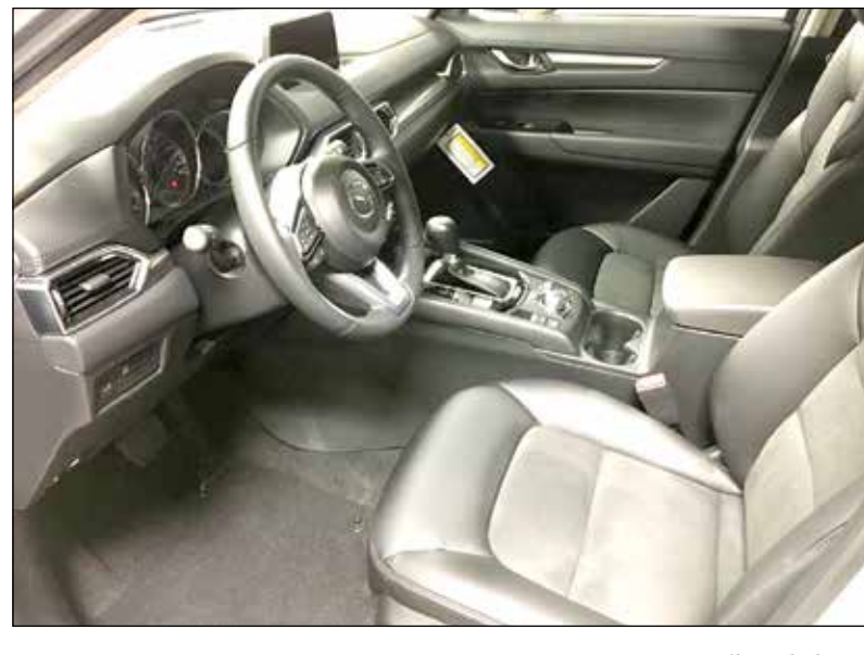
2018 Mazda CX-5 SUV is shown at left. Above, the interior is comfortable and roomy with everything conveniently located for ease and efficiency.