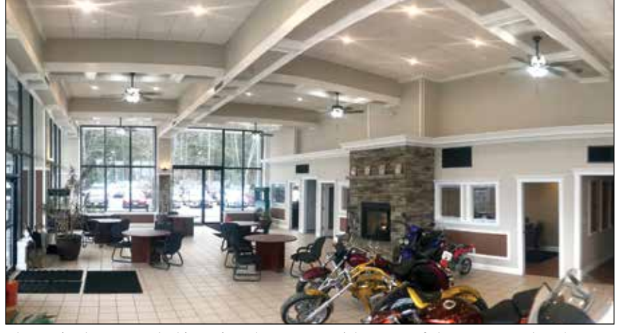
Shown is the upgraded interior showroom with some of the motorcycles that have been taken in trade alongside the warm, brand new stone fireplace.

"The Navigator's technology offerings make a big leap forward," said Roddy. "Wireless hotspot capability for up to 10 devices is standard, and a wireless charging mat up front is optional. There are six USB ports, four 12-volt ports and a 110-volt household outlet plug to keep devices juiced up. An available rear entertainment system mounts 10inch screens to the back of the front seats, which can each play different content via an app, HDMI input or USB-connected device. Android devices will be able to stream content