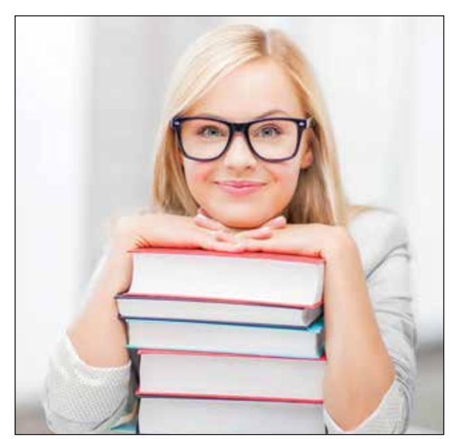
Scholarships are available for those who are willing to put in the time to research their options.

Scholarships can help students offset the rising costs of a college education. Those who are willing to put in the research, time and effort to apply may find a wealth of scholarship opportunities at their disposal.