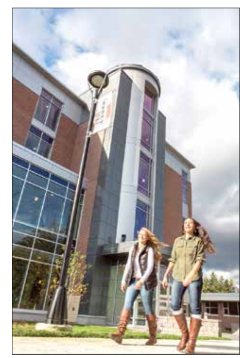
Students walk past The Learning Tower at Central Maine Community College in Auburn.

At CMCC, you'll receive a quality education at affordable prices, one that prepares you for interesting and rewarding work . . . right here in Maine. Want to learn more? Visit our website at www.cmcc.edu or contact us anytime at 755-5273 or enroll@cmcc. edu. And make plans to join us for our fall open house Saturday, Oct. 13, from 9 a.m. to noon. Come to CMCC - your future starts