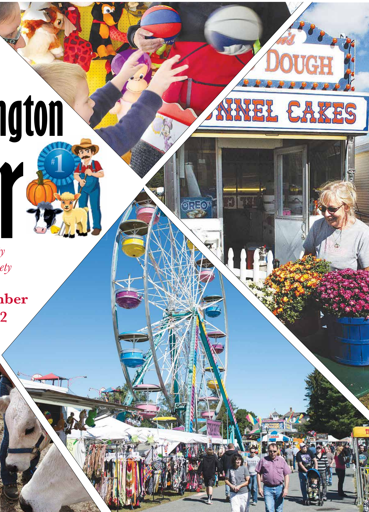
Special Advertising Supplement