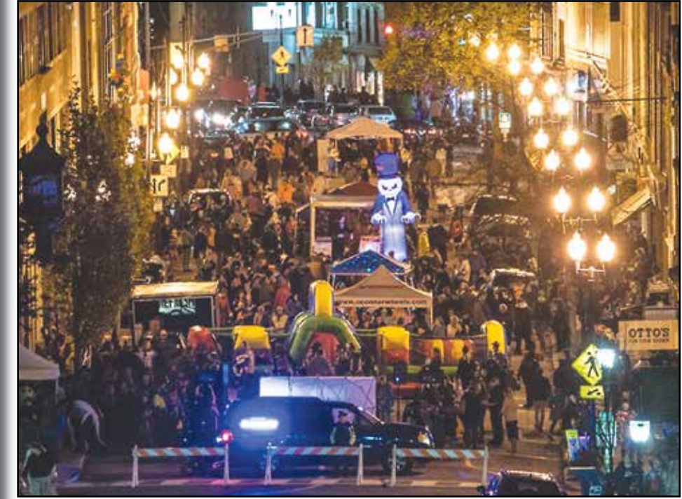
BY AUGUSTA DOWNTOWN ALLIANCE Special to the Sentinel and KJ