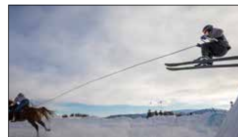
Getting some air takes on a whole new meaning when it’s Skijoring time.

For more information on Somerset SnowFest including a full schedule of events, visit sometersnowfest.org .