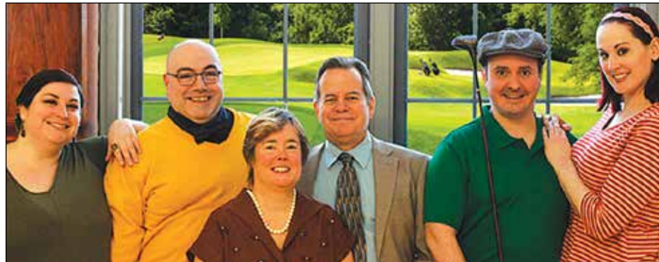
Waterville Opera House photo

Programmed by a volunteer steering committee to present works of cinema from around the world and encourage the shared experience of communal film viewing and thoughtful discus-