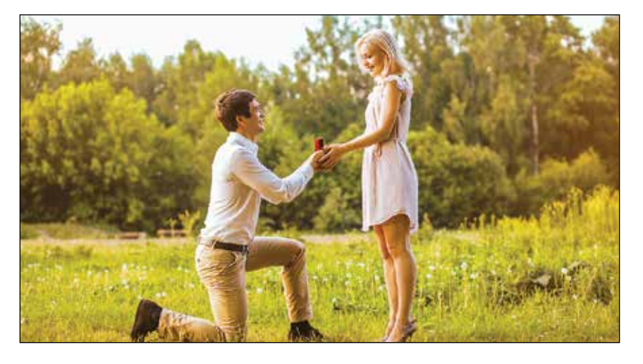
Getting down on bended knee when asking for a sweeheart's hand in marriage remains an enduring tradition

be so excited to propose that he or she fails to consider how the other person in the relationship is feeling. If that person is overwhelmed by work projects or stressed about upcoming events, consider waiting to propose at a more relaxed