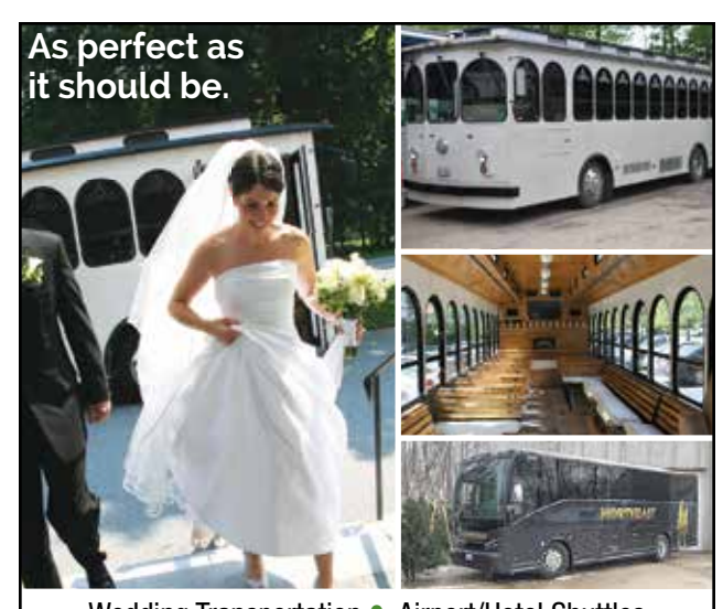
Wedding Transportation • Airport/Hotel Shuttles Bachelor/Bachelorette Parties Photo Sessions Rehearsal Dinners

At Northeast Charter & Tour, we specialize in making your big day as perfect as it should be. We know wedding transportation like no one else. Our diverse fleet includes: