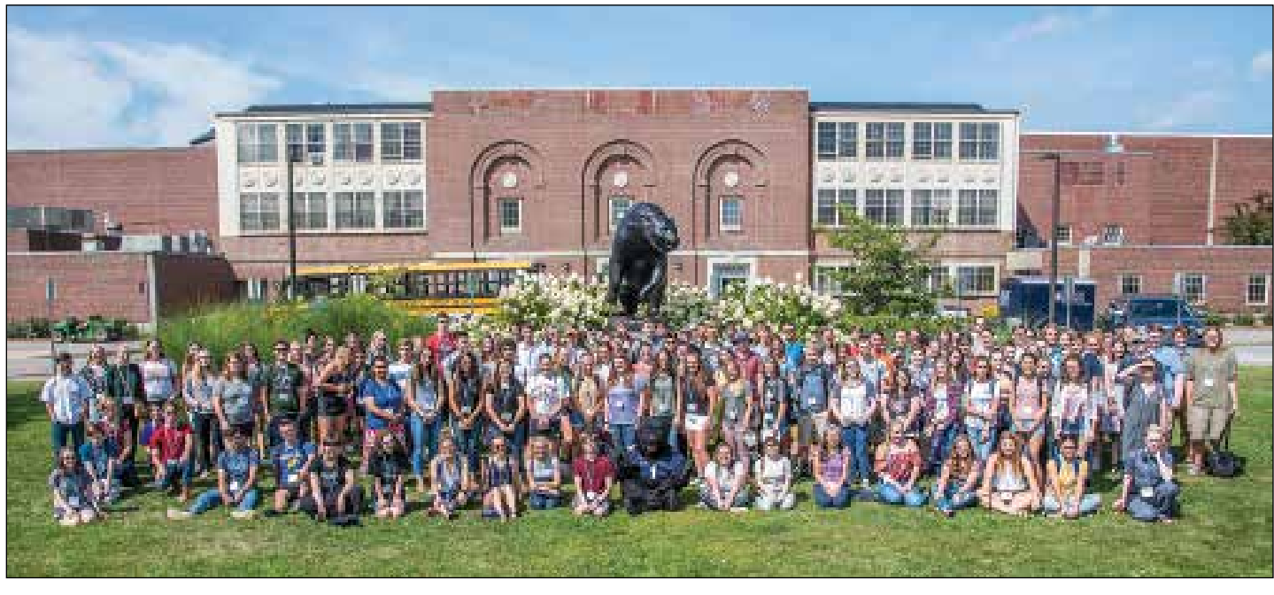
Group photo of the 2018 fall orientation.

Starting May 13, the University of Maine will offer summer courses tuition-free to qualified high school students. Classes are taught by UMaine faculty and meet general education requirements of the University of Maine System, as well as the majority of colleges nationwide. Students across the