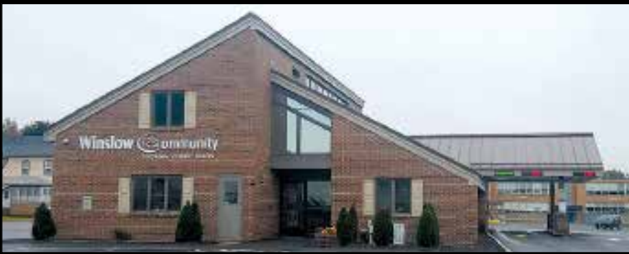
Winslow Community Federal Credit Union