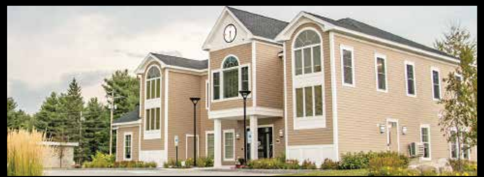
Connected Federal Credit Union