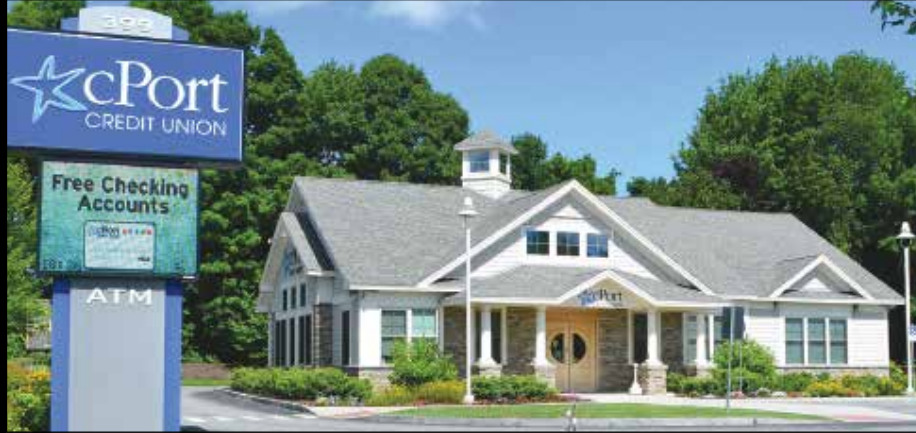
cPort Credit Union