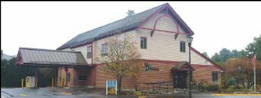
New Dimensions Federal Credit Union