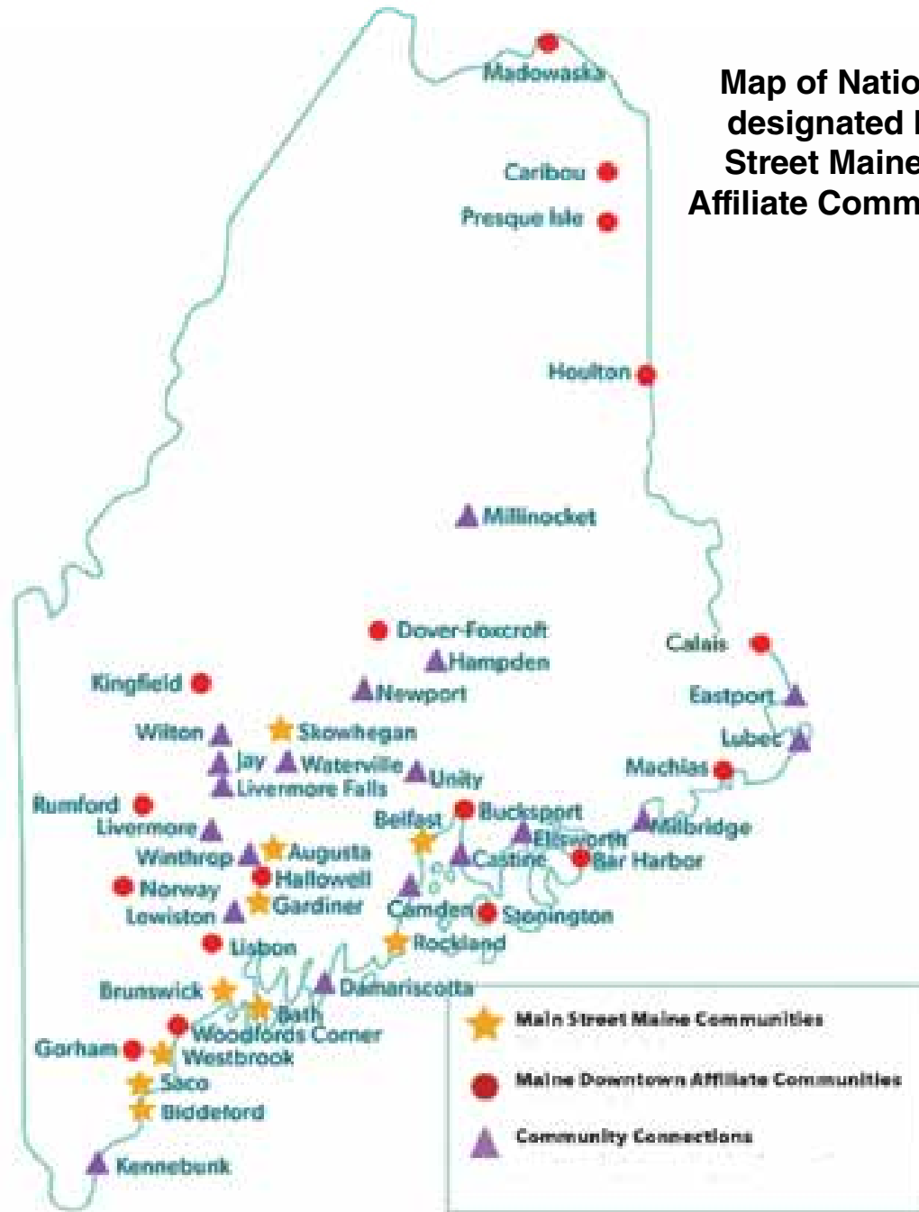
Map of Nationally designated Main Street Maine and Affiliate Communities

Bar Harbor, Bucksport, Calais, Caribou, Dover-Foxcroft, Gorham, Hallowell, Houlton, Kingfield, Lisbon, Machias, Madawaska, Norway, Presque Isle, Rumford, Stonington, Woodfords Corner Neighborhood in Portland