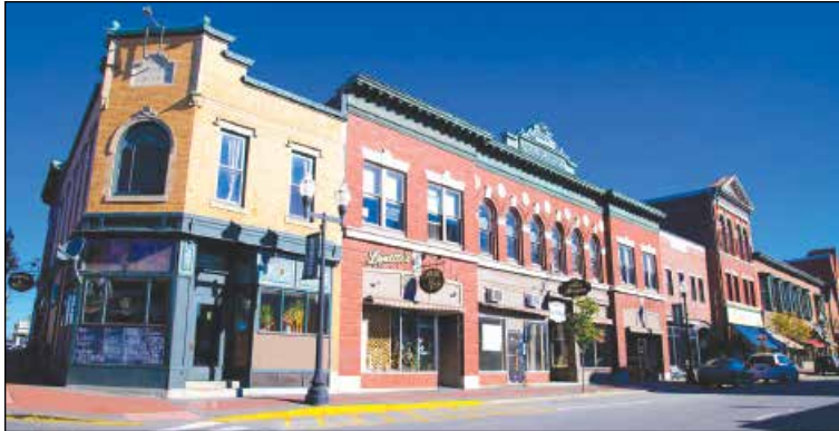
Main Street Skowhegan photo

For both funding opportunities, projects must follow historic preservation standards. Application information will be available in December. Visit mainstreetskowhegan.org/funding for more details.