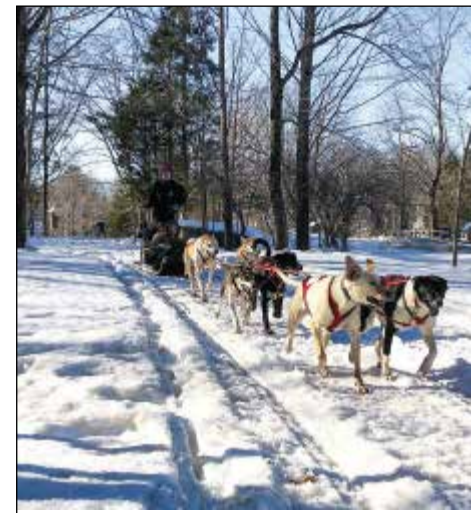
Main Street Skowhegan photo

Check out the dog sled rides at Coburn Park.